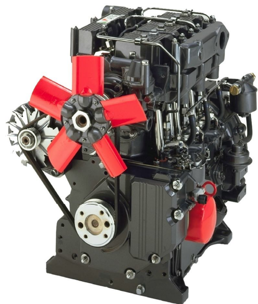
ALPHA SERIES ENGINE